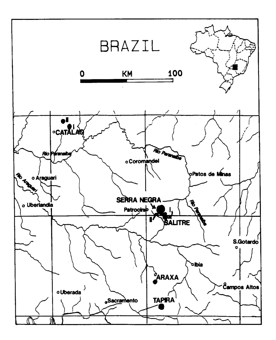
Fig. 2. Location of carbonatite complexes in the Paranaíba province, Brazil.

ore bodies for titanium and phosphate, respectively. The central plug, strongly brecciated and mineralized with pyrochlore, is mined for niobium. Calcite carbonatite bodies within the pyroxenite annulus are not brecciated and contain only minor amounts of niobium as pyrochlore and traces of zirconalite. The pyrochlores from the central plug and outer calcite carbonatite bodies are significantly different in composition. Reaction between carbonatite and pyroxenite resulted in replacement of earlier minerals by phlogopite and biotite, and late hydrothermal carbonate veins transect much of the earlier carbonatite rock.